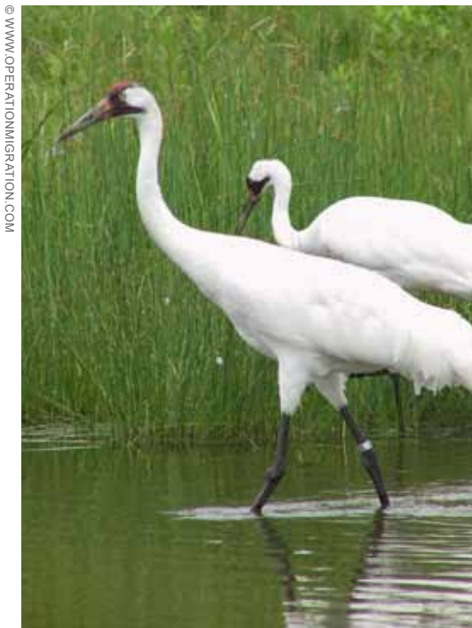
All four North American flyways (Pacific, Central, Mississippi, and Atlantic) cross the Peace-Athabasca Delta, and endangered species such as the whooping crane are delta migrants.

The purpose of this report is to outline the importance of establishing an Ecosystem Base Flow (EBF) for the lower Athabasca River, and to urge the responsible government agencies – Alberta Environment and Fisheries and Oceans Canada (DFO)– to ensure that the final water management plan includes an EBF in order to protect one of Canada’s most important and iconic rivers. 5